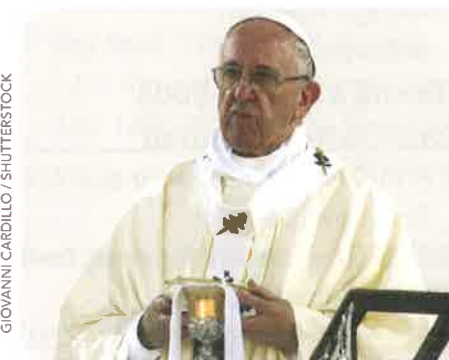
GIOVANNI CARDILLO / SHUTTERSTOCK