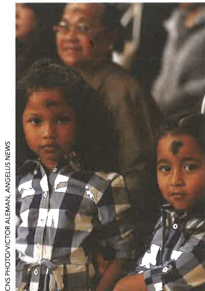
CNS PHOTO/VICTOR ALEMAN, ANGELUS NEWS

From Dear Padre: Questions Catholics Ask , © 2003 Liguori Publications