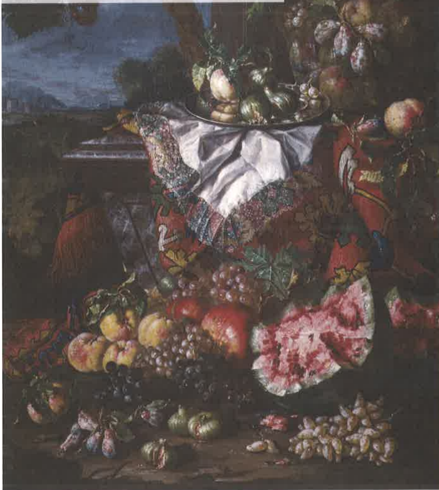
Location: Vatican Museums