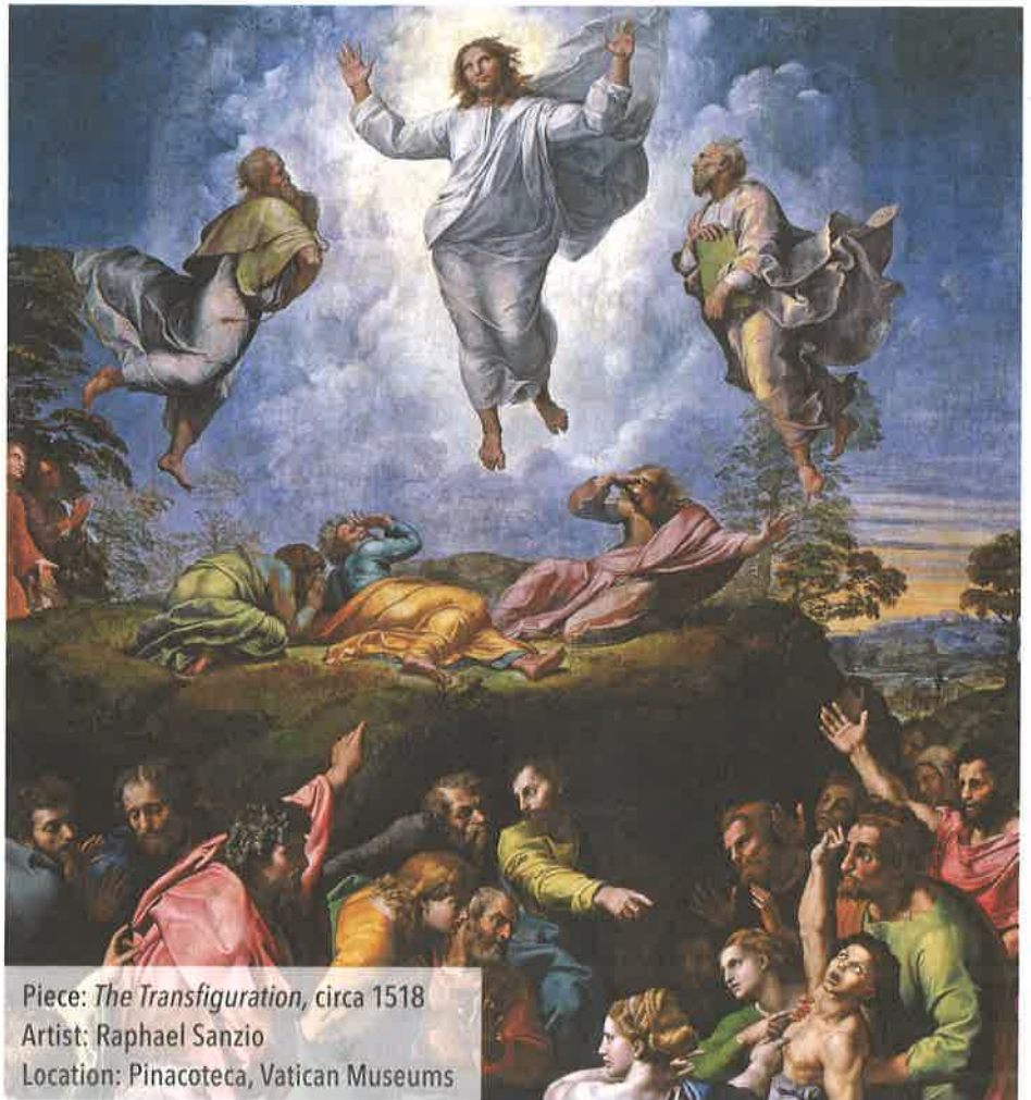
Piece: The Transfiguration , circa 1518 Artist: Raphael Sanzio Location: Pinacoteca, Vatican Museums

Our walk with Jesus is full of contrasts: human and divine, grace and nature, sin and mercy. The Transfiguration by Raphael Sanzio, like the Scripture that inspires it, is also full of contrasts. The composition is in two registers. Up above we have the heavenly glory of Christ enveloped in a fantastic aura of divine light symbolizing his divine Sonship. The power of the experience leaves the disciples prostrate while the two Old Testament figures of Moses and Elijah float in suspended adoration. Down below, we have the other apostles, dealing ineffectively with a possessed boy. There is obvious chaos, with fingers pointing everywhere and faces turning in all directions. There is the serenity of heavenly white against the diabolic and earthly darkness.