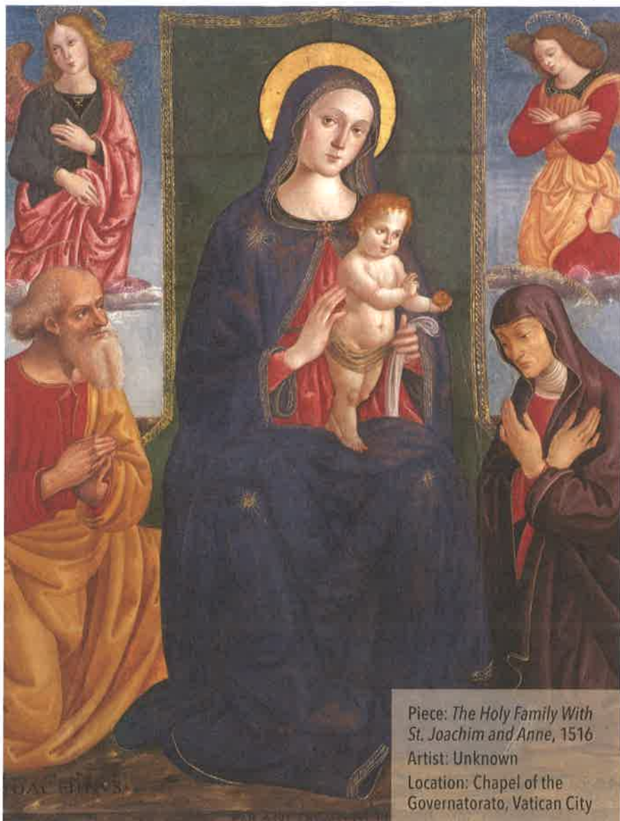
Piece: The Holy Family With St. Joachim and Anne, 1516 Artist: Unknown Location: Chapel of the Governatorato, Vatican City