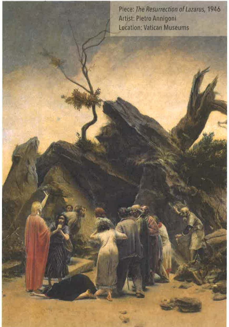
Piece: The Resurrection of Lazarus , 1946