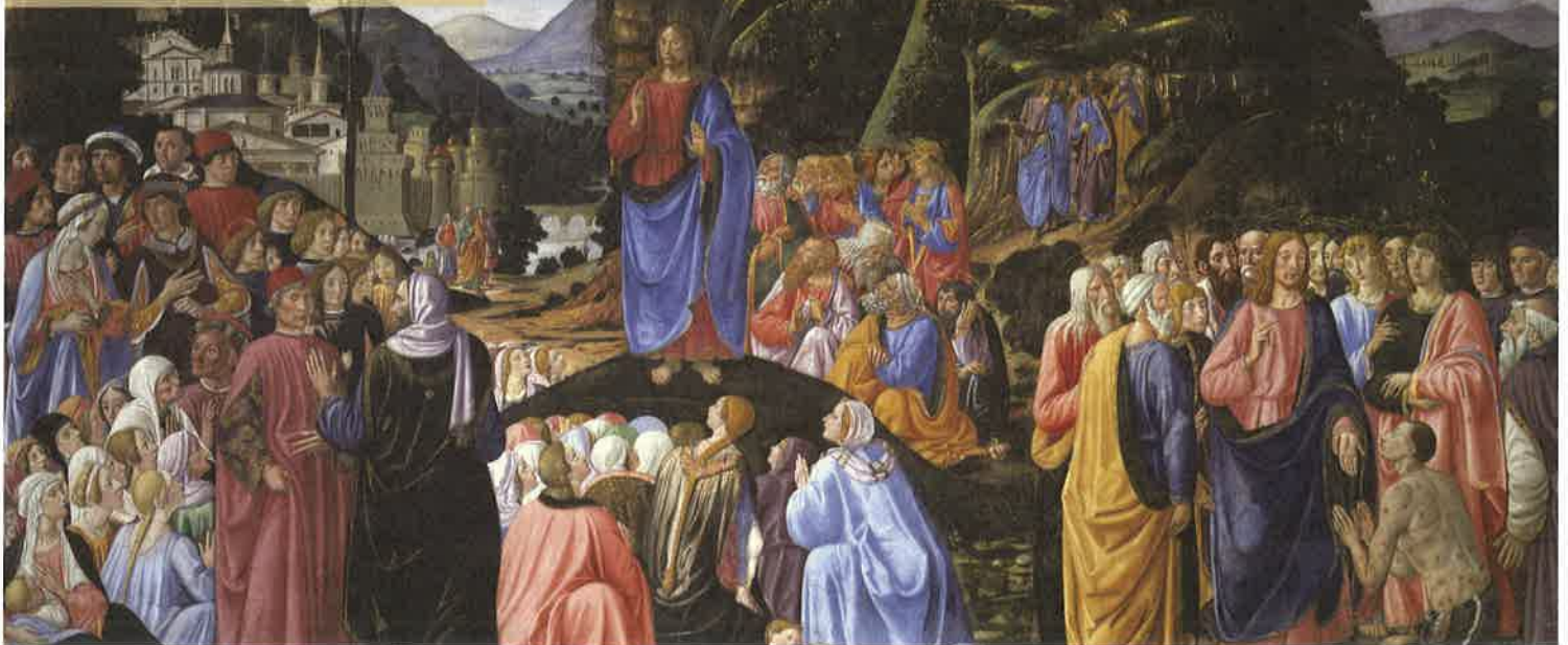
Piece: The Sermon on the Mount , circa 1482 Artist: Cosimo Rosselli Location: Sistine Chapel

"Blessed are they who are persecuted for the sake of righteousness" (Matthew 5:10).