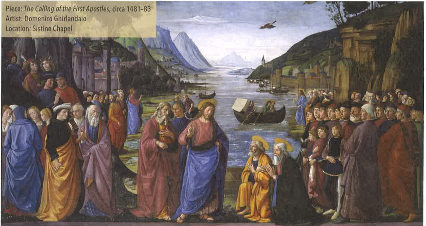
Location: Sistine Chapel