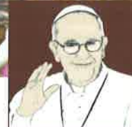
Meeting with Brazil's leaders of society, July 27, 2013