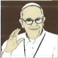
Homily on Epiphany of the Lord, January 6, 2015