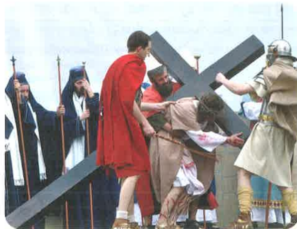
GORA KALWARIA, POLAND